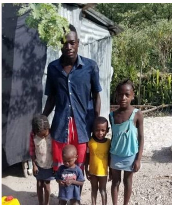
Above: The children of this young family from the mountains near Williamson will now be able to attend school, and receive food assistance from the House of Hope. They, and hundreds of children like them, learn about the

In the beginning was the Word, and the Word was with God, and the Word was God. He was with God in the beginning. Through him all things were made; without him nothing was made that has been made. In him was life, and that life was the light of men. John 1:1-4