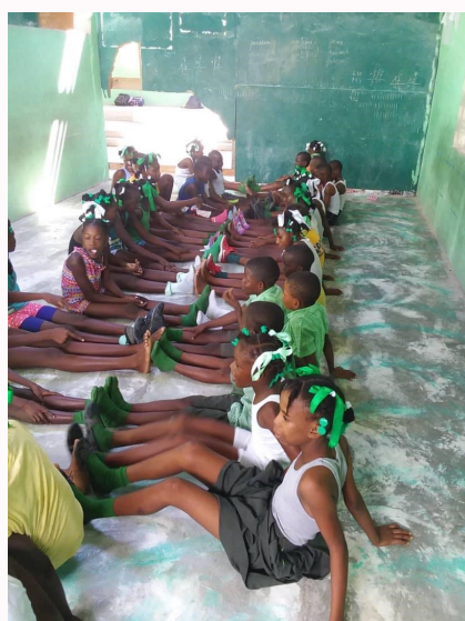
love of the Father for them, through the compassion of His people.